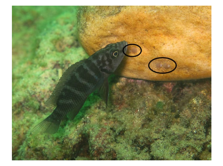
FIGURE 2 Four out of six eggs (two eggs per black circle) laid by the breeding female and inspected by the helper (H4; 27 mm SL). The egg deposition site was on one of the stones used for marking the different territories [Colour figure can be viewed at wileyonlinelibrary.com]

inspected the eggs for a total period of 339 s. Most defence behaviour was shown by the breeding female against the facultative egg predator Telmatochromis vittatus (twice during the spawning and 7 times afterwards), the piscivorous eel Mastacembelus moorii (8 times during spawning and once after the spawning) and against conspecifics (5 times during spawning and 12 times afterwards; see video recordings in Supplement material 1, 2). The breeding male M1 defended the eggs only against conspecific intruders after spawning (6 times in total), but did not engage in cleaning the eggs.